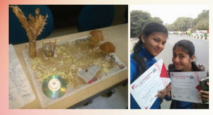
Ist prize in Sri Aurobindo college annual fest Mehak 2017