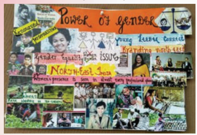
In-house poster competition