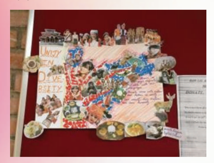
In-house poster competition