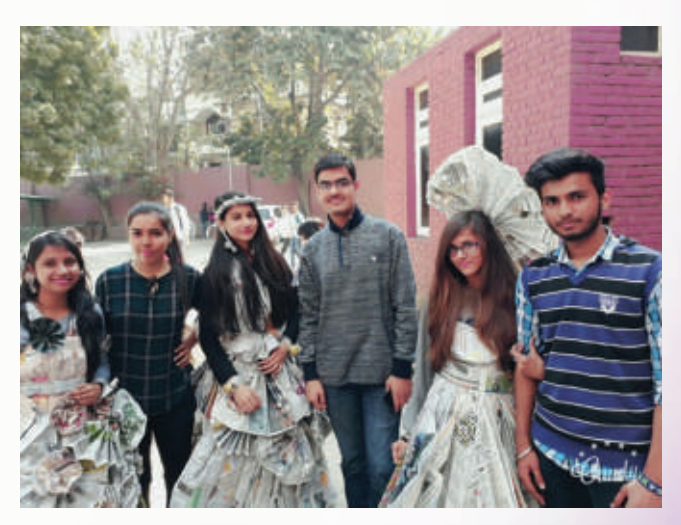
IInd prize in Aryabhataa College for Newspaper Dressing