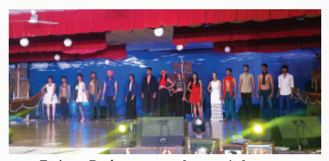
Fashion Performance at Lingaya's Institute

The society members respect their art in full vigour. Till now, they have competed and won accolades in various fests like ABHIVYAKTI [Bharti College], and Lingaya's Institute. Though, they achieved so much in such a short span of time, the society and its members still have a long way to go.